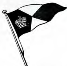
ROYAL VANCOUVER YACHT CLUB

Sponsored By The ROYAL VANCOUVER YACHT CLUB And The LAHAINA YACHT CLUB