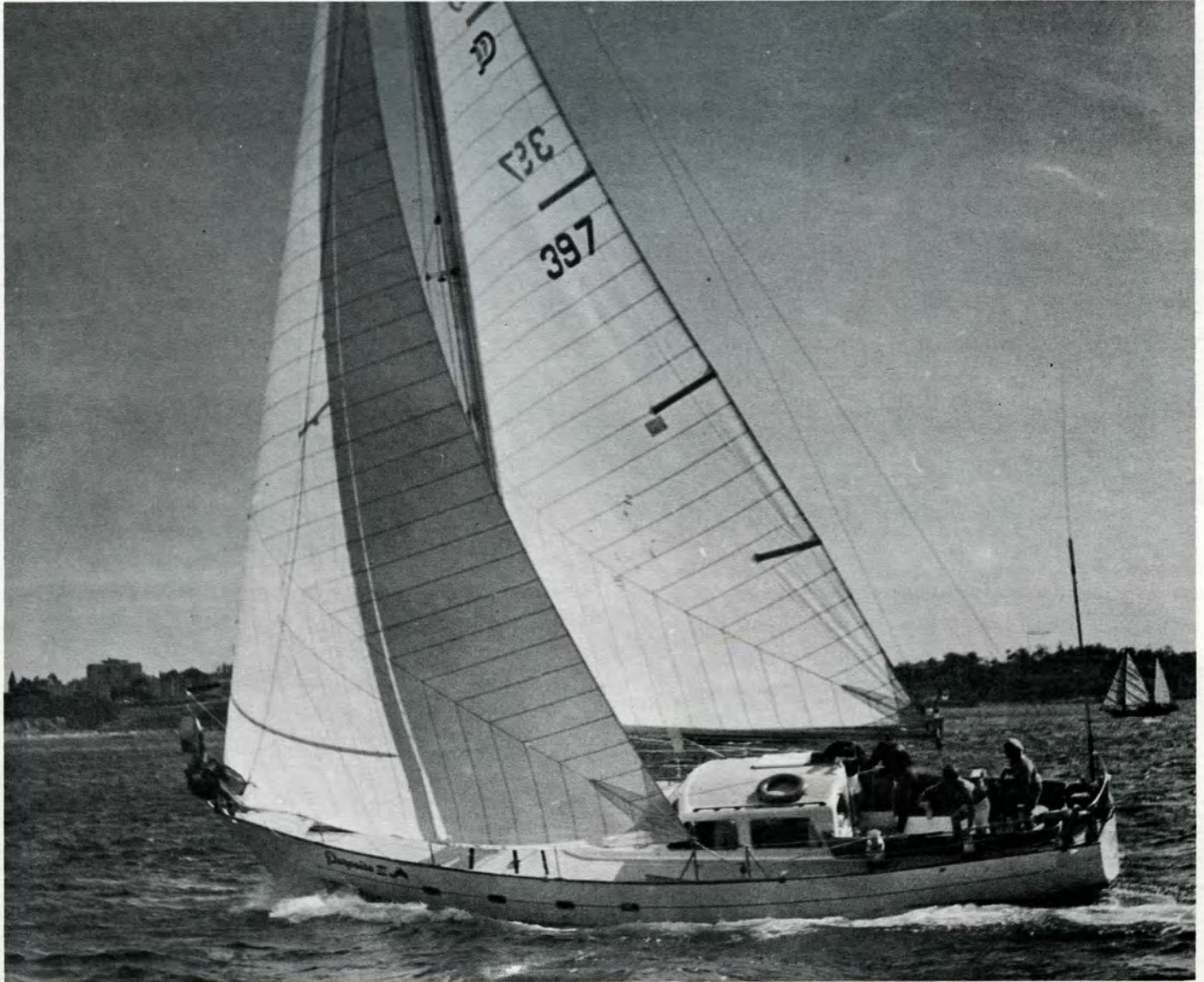
"PORPOISE III" — 1st Overall, Elapsed Time, 1968